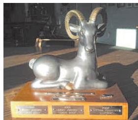
William J. Dubuc Trophy — Awarded for Offshore 160's Best Elapsed Time Finish