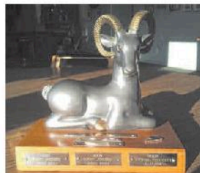
William J. Dubuc Trophy — Awarded for Offshore 160's Best Elapsed Time Finish